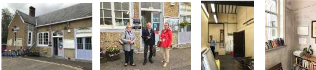
Eynsford station – front, with visitors from Rail Heritage Trust, waiting room, ticket office

The station adoption groups have started to begin working on projects although clearly additional lockdowns slowed this activity down. To compensate, we have been focusing on buildings and access issues, in particular working towards obtaining funding – including discussions with the Rail Heritage Trust - to restore the characterful Victorian station buildings at Eynsford and Shoreham (Kent) .