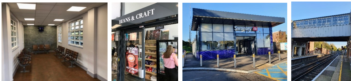
Refurbished waiting room; café; new south entrance to Swanley; renovated footbridge

With Swanley now completely renovated and a lively and well-used café in place, we are turning our attention to displays in the waiting rooms, working with the Swanley History Group to find stories to communicate. Plans are afoot to add a Talking Lamppost too, part of a national project to encourage communities to text their stories to coordinating groups, collecting local history and responses.