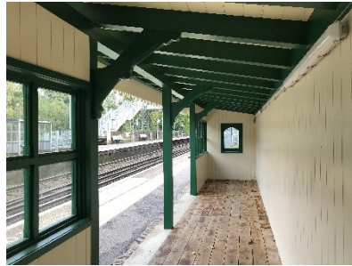
Eynsford station – top row, before renovation and process, bottom row, finished rooms and celebrating with Rail Heritage Trust and Southeastern, and the fabulous new shelter

With Swanley now completely renovated and a lively and well-used café in place, we are turning our attention to displays in the waiting rooms, working with the Swanley History Group to find stories to communicate. Plans are afoot to add a Talking Lamppost too, part of a national project to encourage communities to text their stories to coordinating groups, collecting local history and responses.